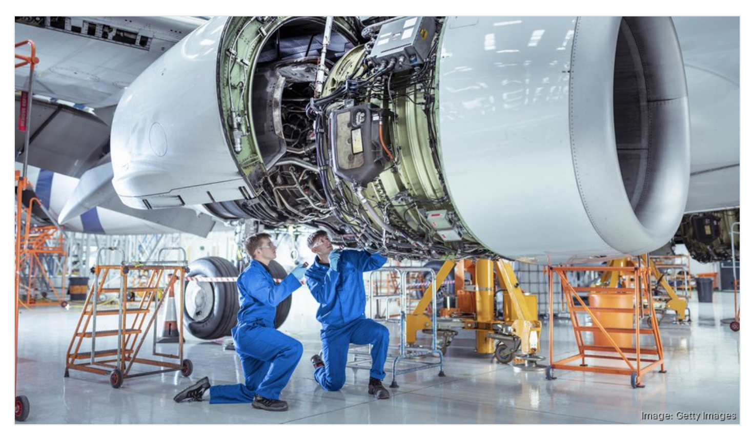
Leveraging regional labor markets, Maricopa Community Colleges aligned cutting-edge programs to meet the workforce needs of the aerospace manufacturing industry.